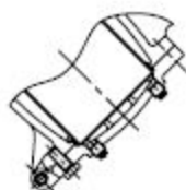
SIZE 8 &amp; LARGER